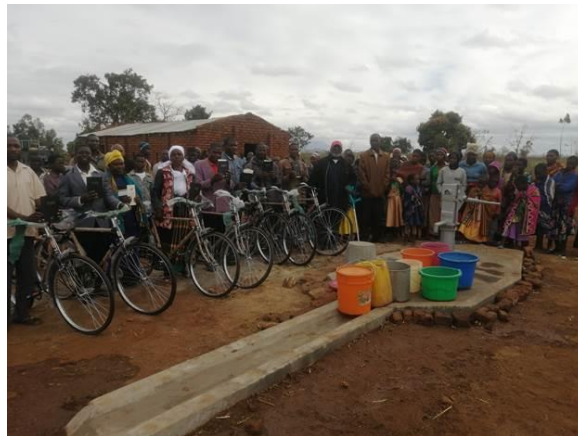
Double blessings. Praise the Lord!

The Church and the villagers were so happy for everything they have witnessed.