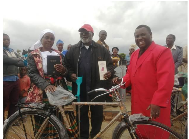
Very thankful after receiving a Bicycle and a Bible.