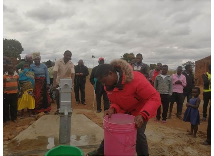
Handing over the water well to the community