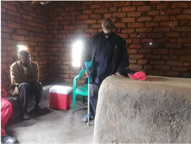
Sharing the Word at Malaina Church.

Greetings to you in the name of Jesus Christ. I want to share with you the good news of what the Lord has done once more!